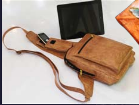
Contemporary designs like this iPad bag and accessories, all locally produced by skilled artisans: we sell no imported products