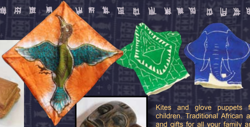
Kites and glove puppets for children. Traditional African art, and gifts for all your family and friends, as well as that very special exotic treat you deserve.