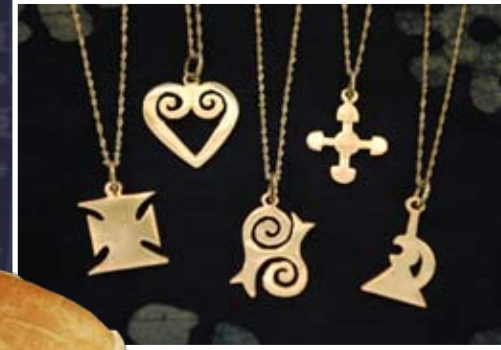
Support local artists and craft workers and get memorable gifts. You may be able to buy cheaper but no one else can make our guarantees.