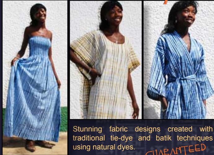
Stunning fabric designs created with traditional tie-dye and batik techniques using natural dyes.